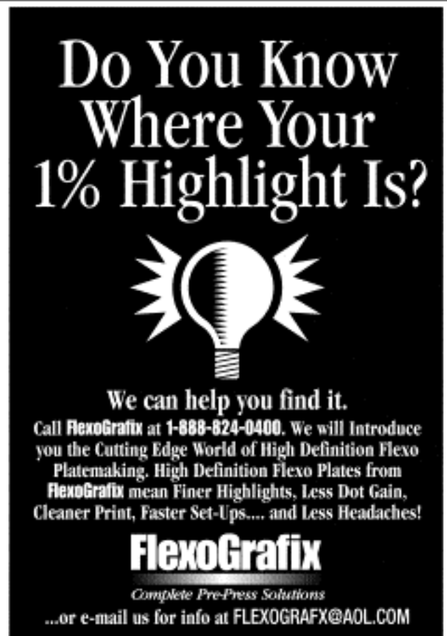
Circle 31 on Info Card or visit www.packageprinting.com/rs4